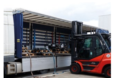
Truck loading and unloading from one side