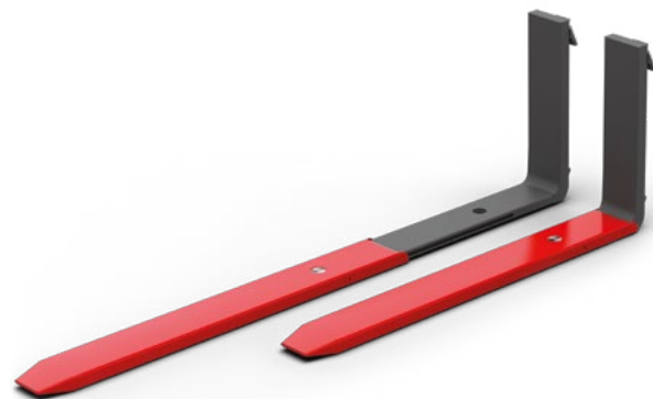
ManuTel ® G2 SlimLine edition