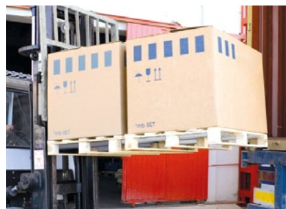
Transport of several pallets at the same time