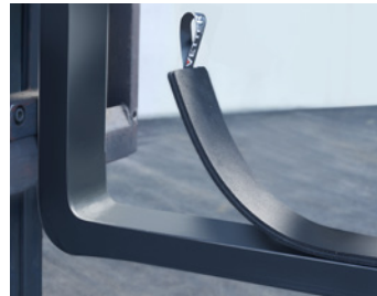
With bracket for an easy take off