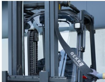
Attach to the lift truck when not in use