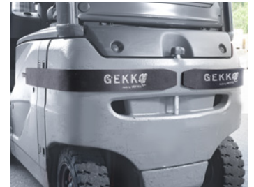
Also applicable as impact protection at the forklift chassis