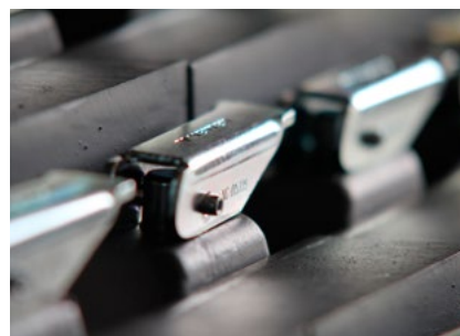
Locking mechanism with VETTER locking device