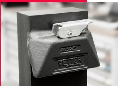
VETTER locking device and fork hook