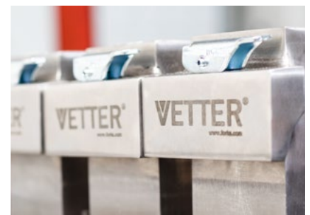
Optional: fork hook made of 100 % stainless steel