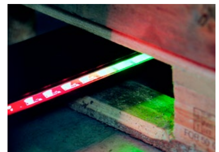
... to determine the entry depth