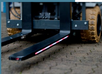
LEDs laterally integrated in the fork blade.