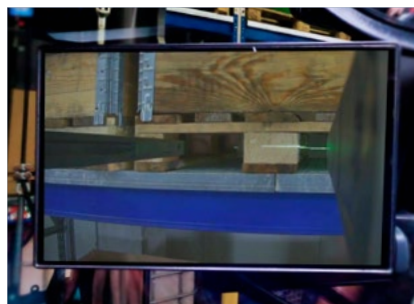
SideCam – Targeting pallet pockets along the forks