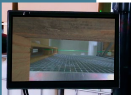
FrontCam – View in front of the picked up load