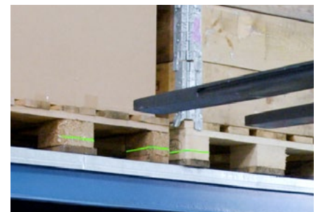
Laser – Targeting pallets using the green laser