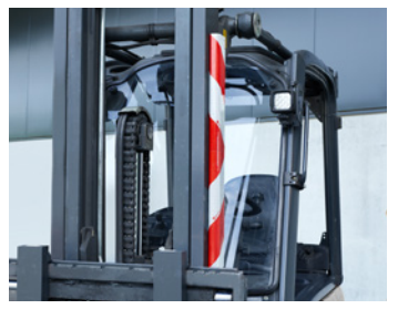
Easy mounting on the forklift when not in operation