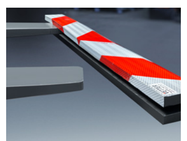
Magnetic entry pockets ( NO machining of forks necessary)