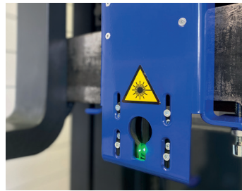
Cross laser green, protection class 1M