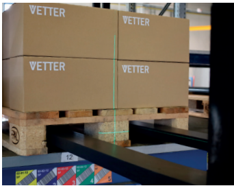
Precise targeting by using a cross laser