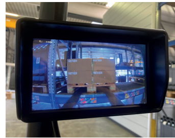
Monitor display in driver's cab